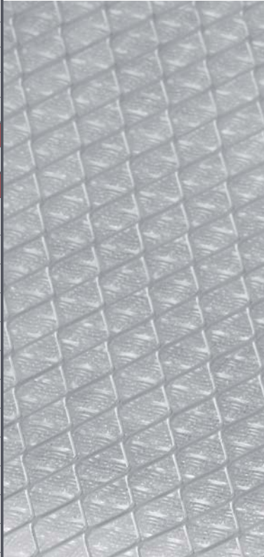
AIR-LAID POLYESTHER CORE